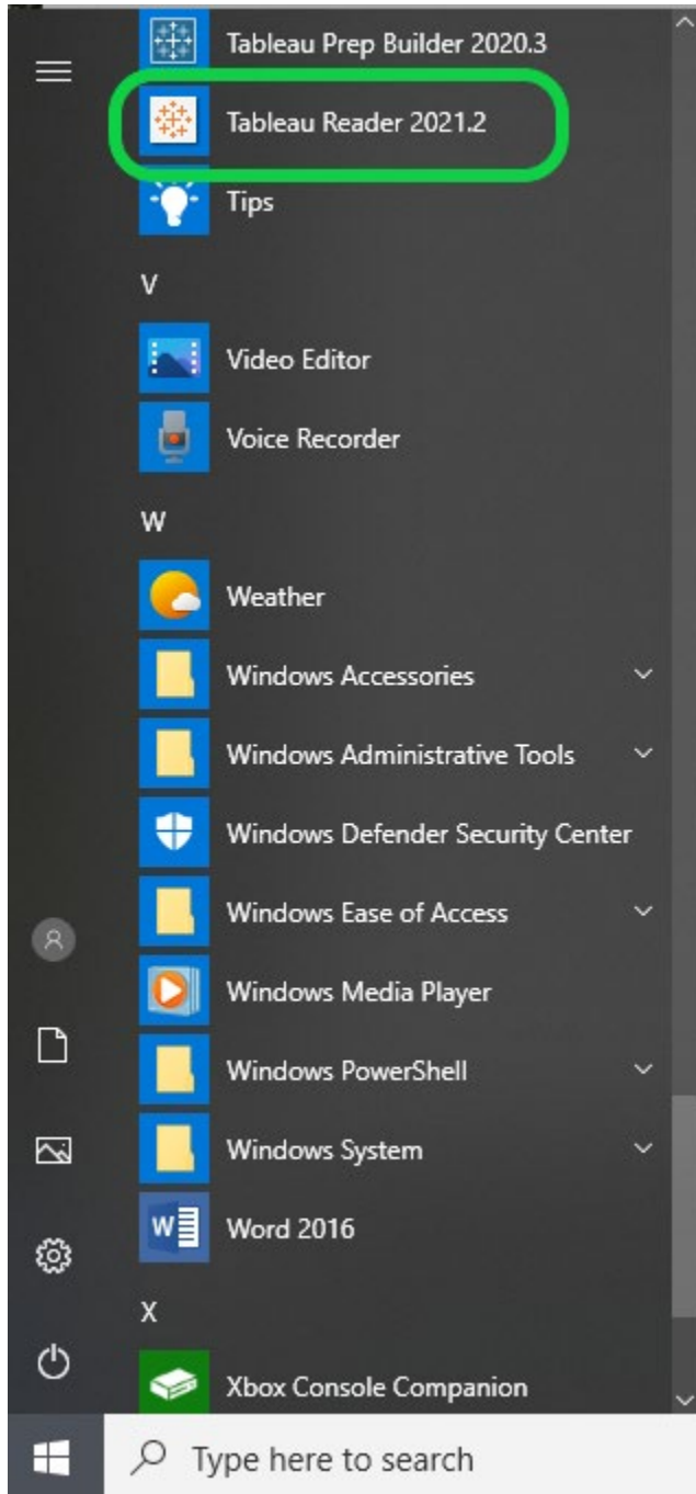
Tableau Reader will be installed automatically (as long as the pc/mac is on and connected to the Internet). It will happen seamlessly in the background. Once installed, the icon will appear in the Start Menu on the left panel as well as on the Desktop for PC's.

For Mac's the Tableau Reader application icon will be in the Applications folder.