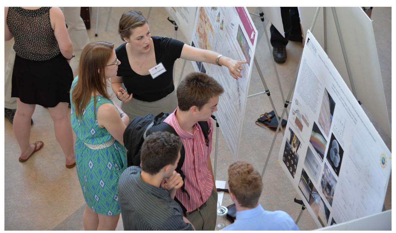
Union College students participate in advanced, hands-on research experiences in the laboratory and in the field. These students share the results of their scholarly endeavors at poster presentations and the annual Steinmetz Symposium

\mathbf{E} xisting catalytic converter systems use rare precious metals to catalyze exhaust gas. Decreasing the use of these metals has the potential to transform automotive pollution clean-up methods. This has important economic implications for the nation because a typical automobile catalytic converter contains about $100 of precious metals, adding about 700 million dollars per year to the total cost of cars sold in the US. Aerogels are lightweight, nano-porous materials with lots of surface area and good thermal properties. Catalytic aerogel materials have the potential to replace the precious metals while being both cost-effective and environmentally friendlier than current automotive catalysts. This project funds an interdisciplinary team of faculty and undergraduate students in Mechanical Engineering and Chemistry at Union College who are undertaking fundamental studies of catalytic aerogel materials and demonstrating the utility of these materials as catalysts to alleviate automotive pollution.