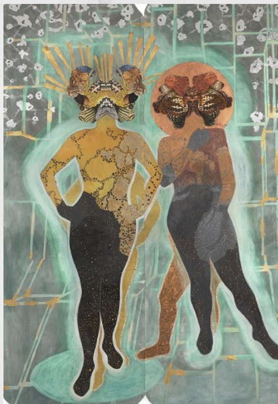
"Return 2 Earth," 2017, mixed media on paper

To browse select collection items, please see our Permanent Art Collection portal or website . Items from the Collection are available for class use and student research. Faculty interested in exploring the Permanent Collection, can contact Julie Lohnes at lohneshj@union.edu for a consultation.