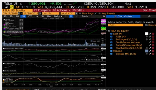
The Bloomberg Terminal dashboard.

If you are interested in the library purchasing materials for research or teaching needs, or to add to our collection, use the Suggest a Purchase form. You can also contact Raik Zaghloul, Head of Collection Development, at zaghloul@union.edu .