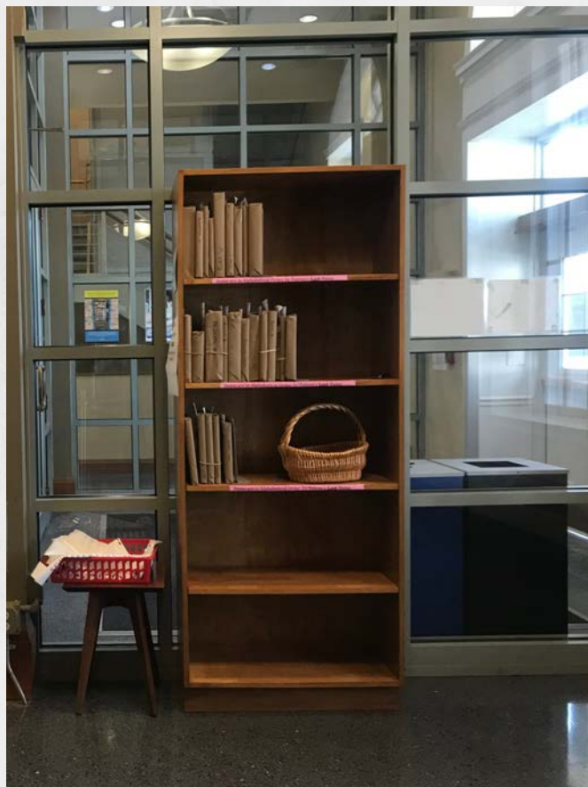
Schaffer Library's new Hold Shelf. Request items for pick up here!

If you or your students are on campus and need anything from the physical collection (e.g., books, media), you can submit a request for the item to be checked out for you and put on the Hold Shelf, located to the left of the front door (limited access includes picking up Hold Shelf items). If you or your students are studying/working remotely, you can use the request process to have items from our physical collections mailed to or scanned for you. For more information on this requesting process, visit the Circulation and Reserves webpage. Please contact Robyn Reed, Head of Access Services, at reedr@union.edu with any questions.