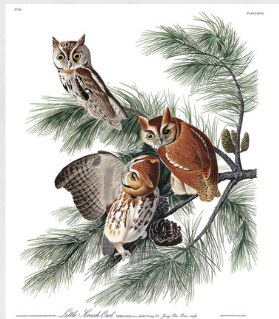
Little Screech Owl from John James Audubon's Birds of America prints.