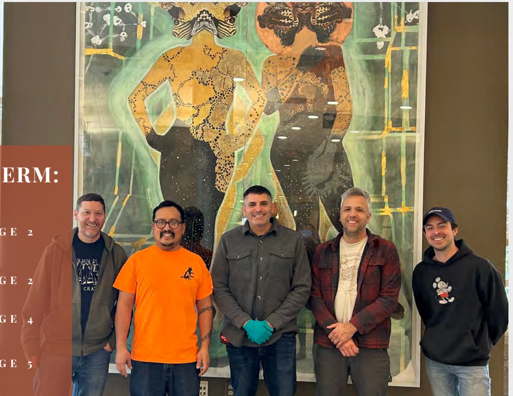
Return 2 Earth returns to the Lally Reading Room with the help of skilled art handlers from Archive Fine Art based in Saugerties, NY.