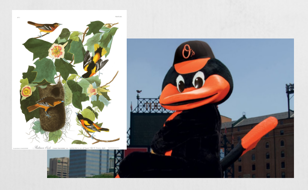
The Baltimore Oriole from Audubon and the Baltimore Orioles mascot.

Stop by Lally Reading Room and check out the original 19th century Audubon prints featuring: the Baltimore Oriole; the St. Louis Cardinals; the Toronto Blue Jays; and the Washington Nationals whose mascot is Screech, a bald eagle.