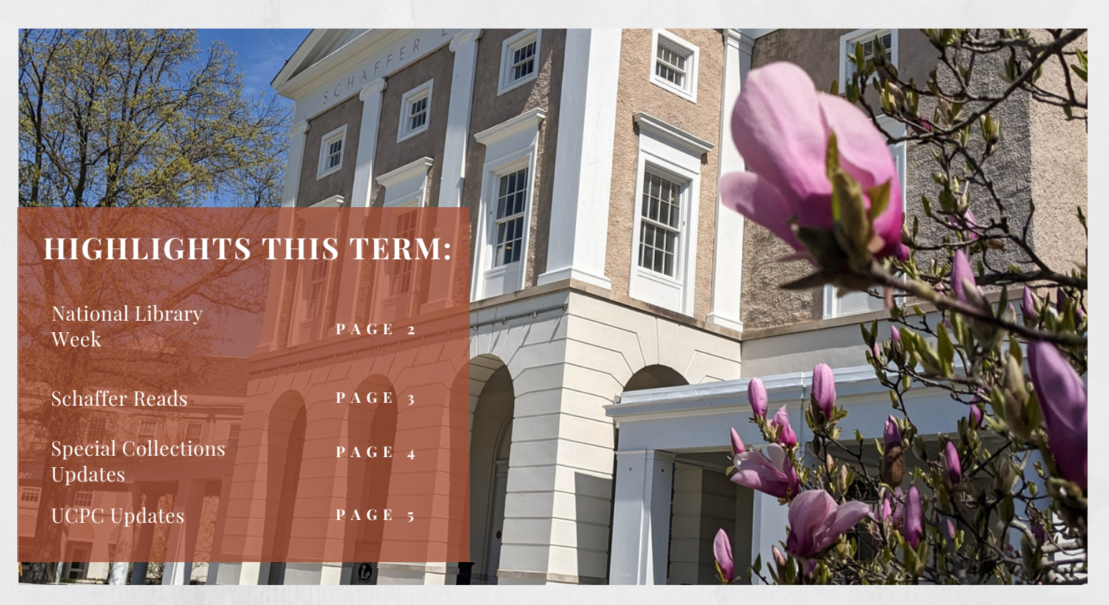
Springtime at Schaffer Library.