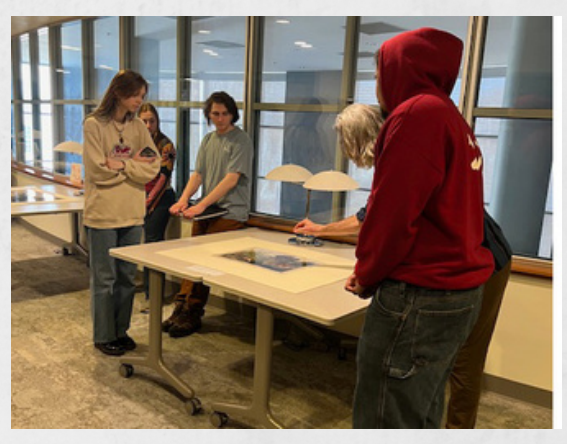
Visual Arts classes visiting Special Collections during Winter Term.