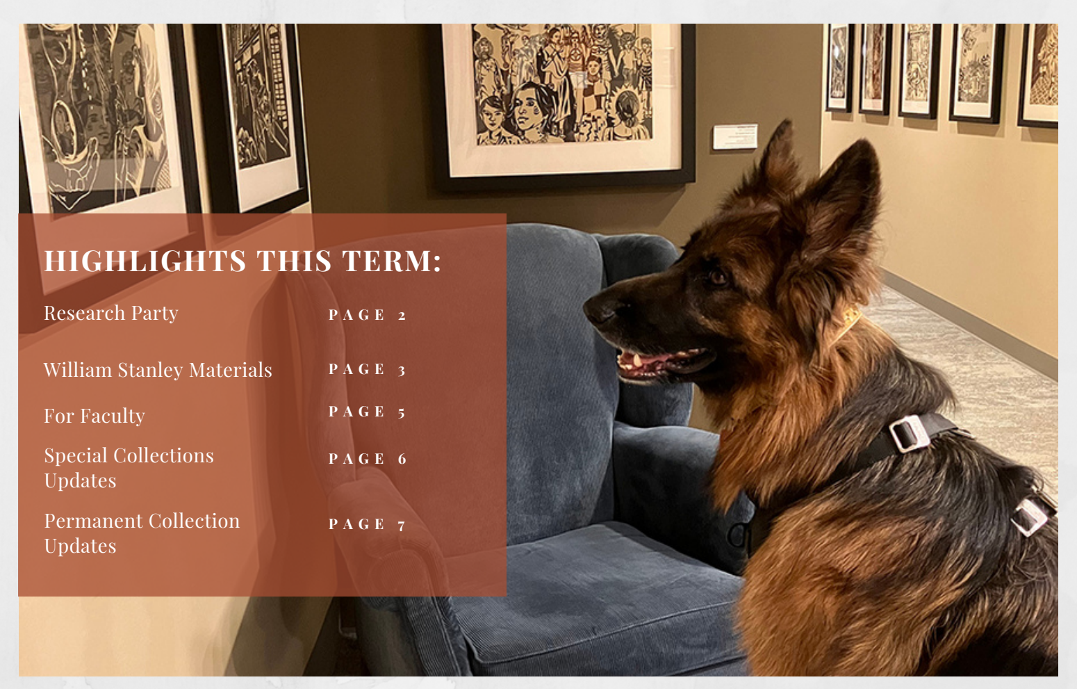
Bee admiring art on the 3rd floor of Schaffer Library