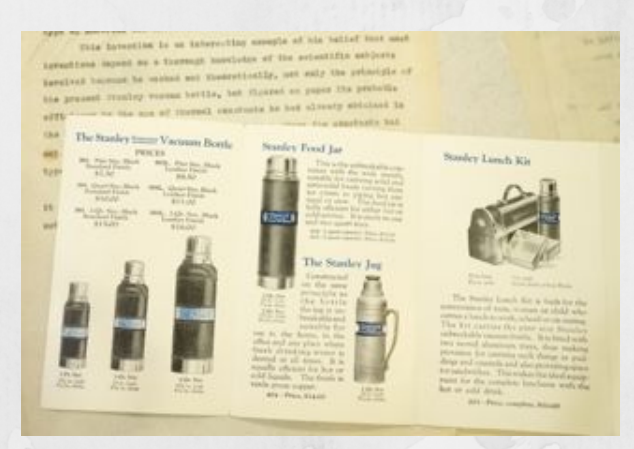
An early brochure featuring Stanley's steel, double-walled, vacuum-sealed bottle

Selected materials from our newest digital collection, the William Stanley, Jr. Collection, are now available online.