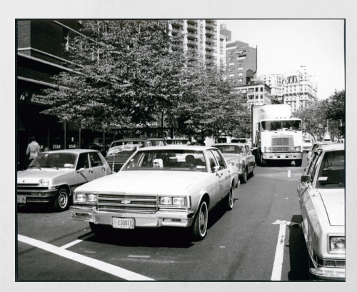
Andy Warhol (American, 1928–87), Cars on the Street, n.d., gelatin silver print © The Andy Warhol Foundation for the Visual Arts, Inc. Union College Permanent Collection. 2008x.9.148 UCPC