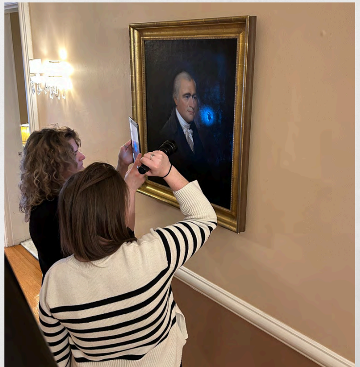
Conservators examine Ezra Ames' portrait of Alexander Hamilton.

The Permanent Collection recently engaged a team of art conservators from the Williamstown Art Conservation Center to review the artworks hanging in Memorial Chapel and the President's House. Several of the portraits and other paintings were recommended for treatment. This treatment will take place at intervals over the next several years.