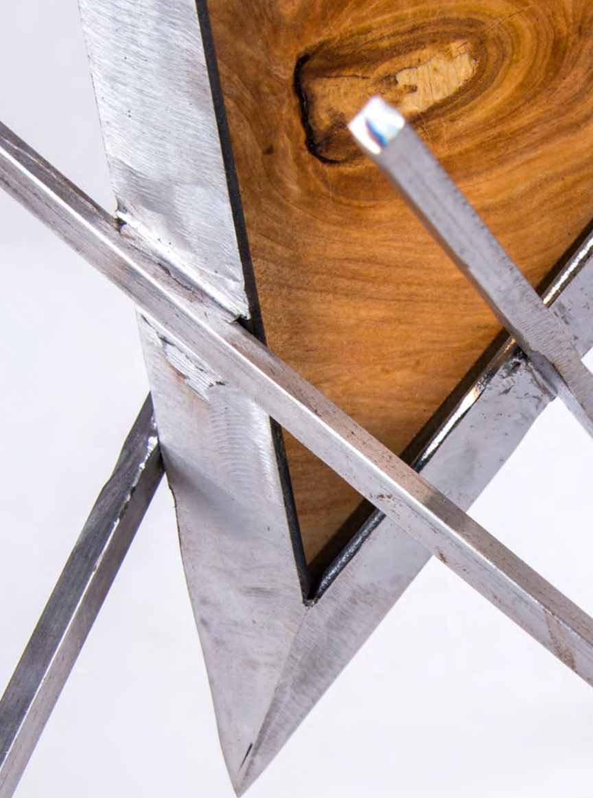
ABBY GOLODIK Precarious Balance